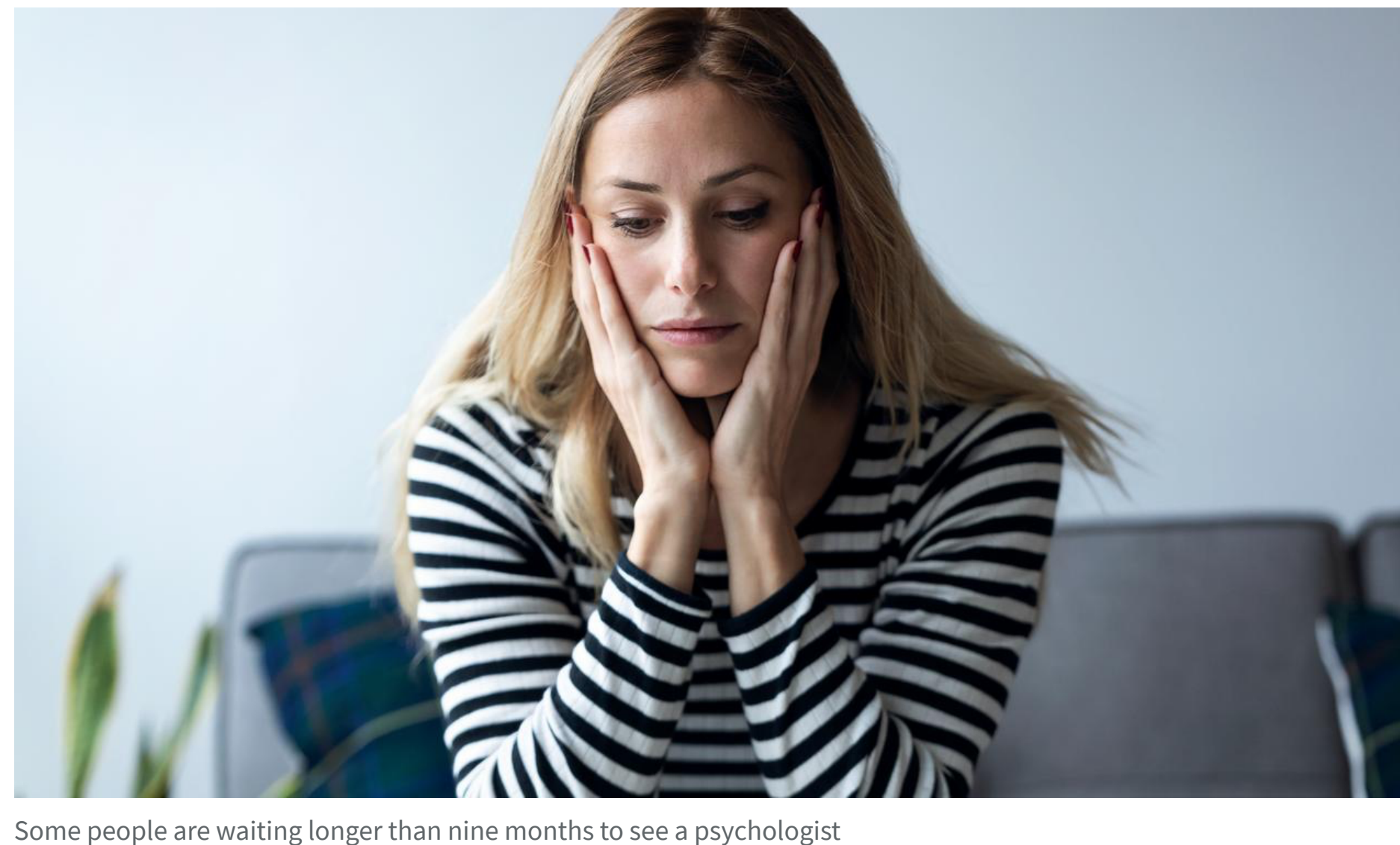
Some people are waiting longer than nine months to see a psychologist

Provisional psychologists – or students who have completed at least four to five years of formal university education and are in the last stages of supervised practice before reaching full registration – can work with clients, and often, already work in private practice under the supervision of a qualified practitioner.